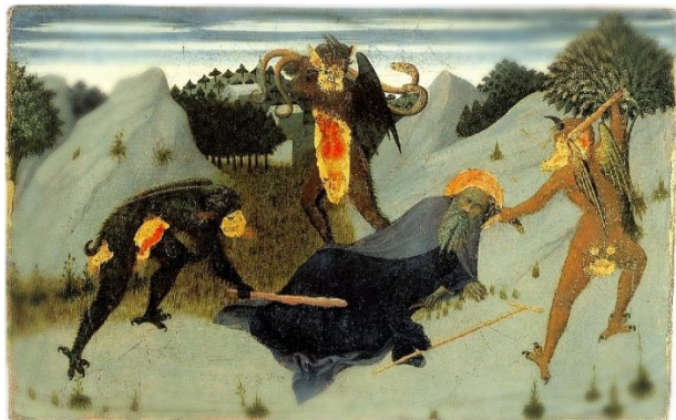
St. Anthony Beaten By Devils, Public Domain

God usually keeps Satan on a tight chain. His power and actions are limited.